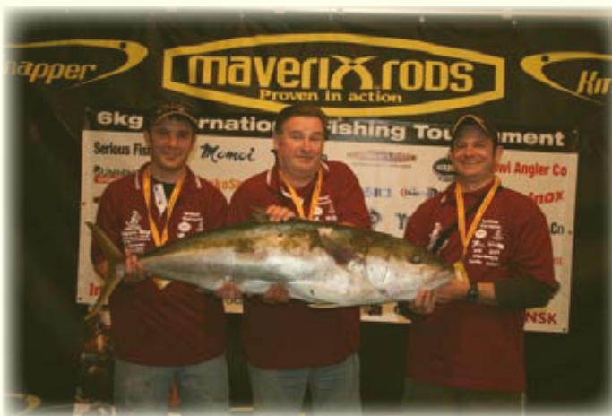
Team Relentless with the new Record Kingfish 23.66kg on 6kg Momoi Line.